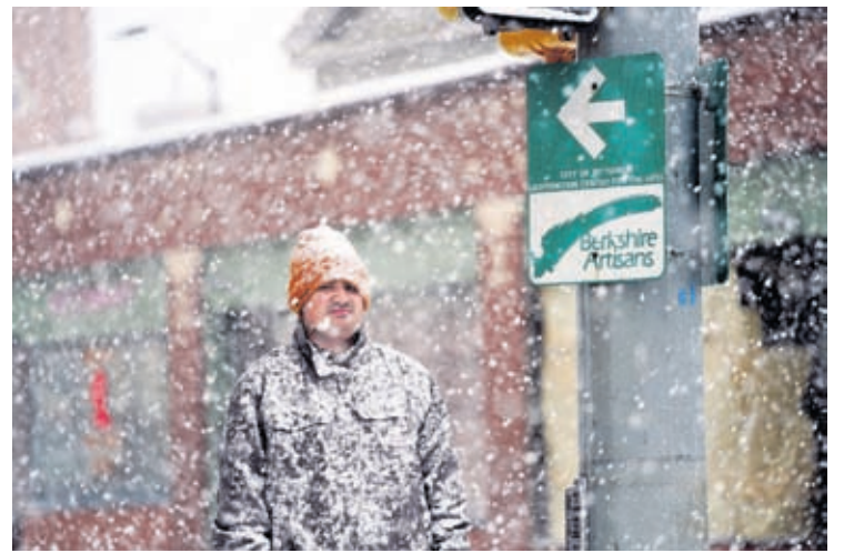
A man is covered in snow on Fenn Street in Pittsfield, Mass, Friday, Dec. 16, 2022.